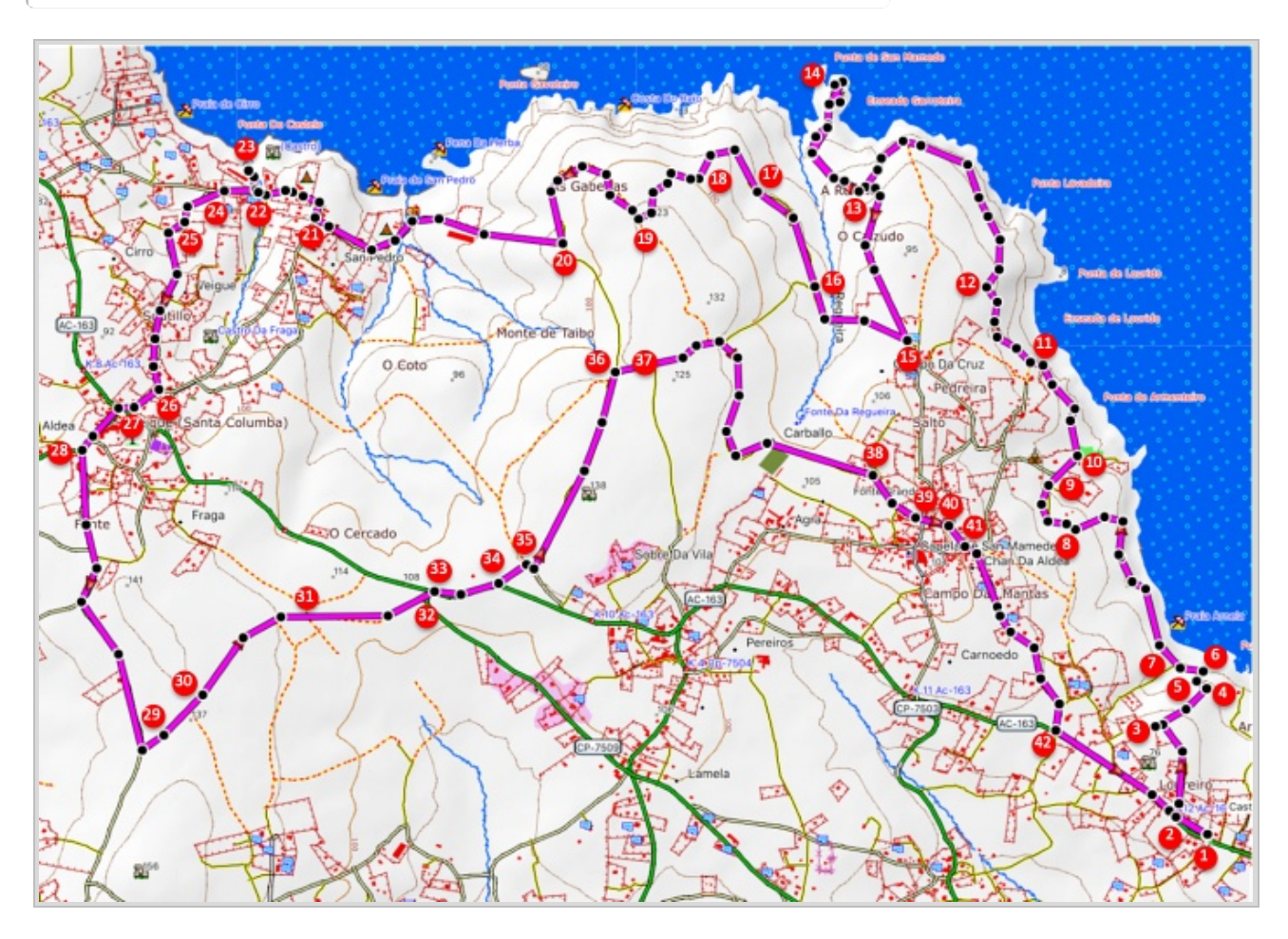
\ensuremath{\mathbb{C}} Ibereffect S.L. All rights reserved.