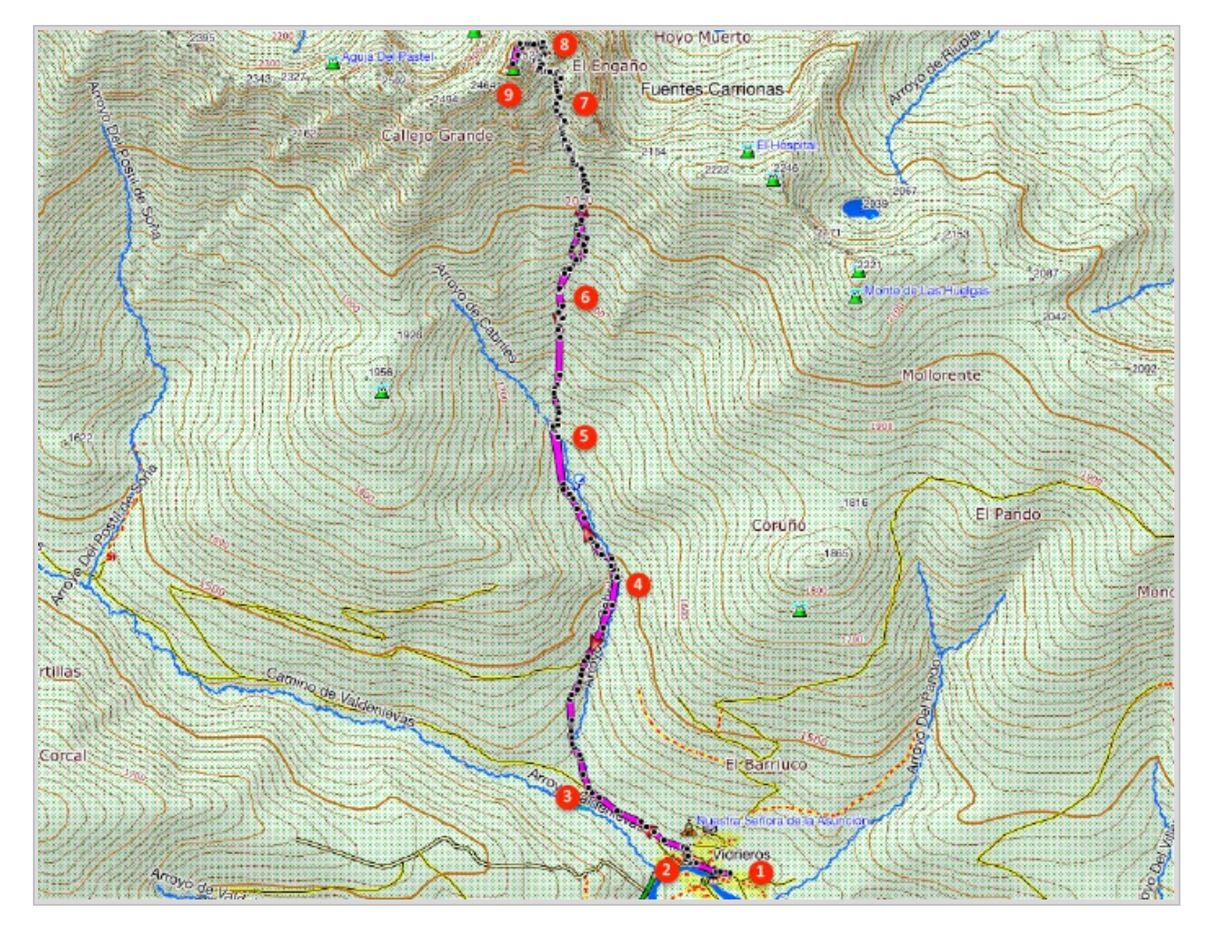
© Ibereffect S.L. All rights reserved.